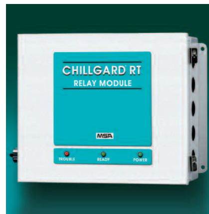
Chillgard RT Refrigerant Monitor Relay Module

The Chillgard RT Remote Relay Module provides discrete relay outputs on a per-channel basis when the Multipoint Sequencer is in use. Eight, sixteen, or twenty-four relays can be utilized to provide a