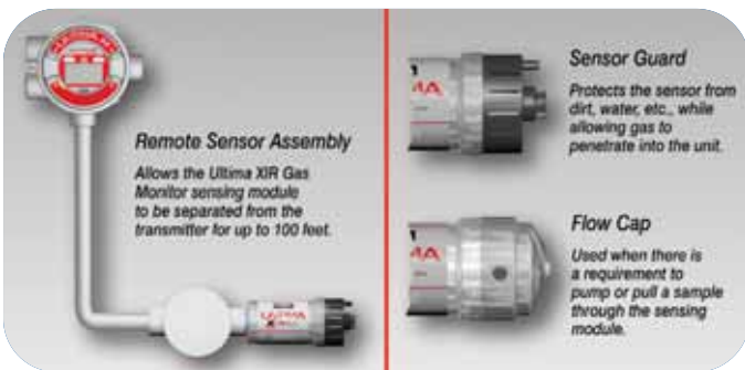
Ultima XIR Accessories

The presence of a combustible gas in the open volume will reduce the intensity of the source emission reaching the analytical detector but not the intensity of the source emission reaching the reference detector. The microprocessor monitors the ratio of these two signals and correlates this to a %LEL combustible reading.