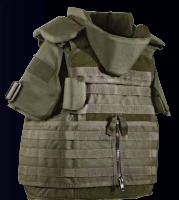
RAV 05 Version, smoke green, shown with optional front yoke, collar, shoulder and bicep protectors