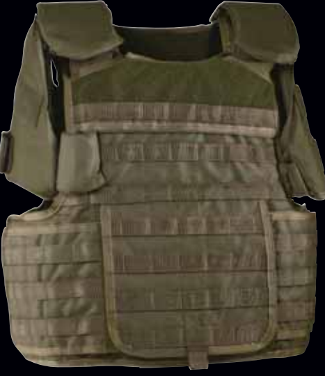
RAV 07 Version, smoke green, with low-profile flat-front Molle grid with no closure hardware

The Modular Vest Light (MVL) is designed for the professional that wants the lightest weight vest carrier possible, yet still offers unsurpassed quality and reliability.