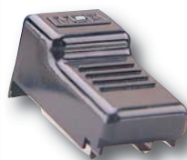
Remote Adapter Cover

The state-of-the-art Ultralight Cap Lamp System has the brightest prefocused spotlight available (tungsten halogen) and provides exceptionally brilliant illumination of the work site. It has a long-life Luminator battery and a variety of battery charging equipment available.