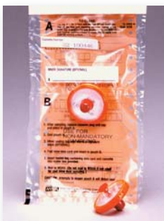
General Purpose Cassette

Because of the extreme accuracy of the MSA weighing process, users of this cassette can sample the atmosphere for dust particulate and have the analytical analysis performed with complete confidence in its accuracy.