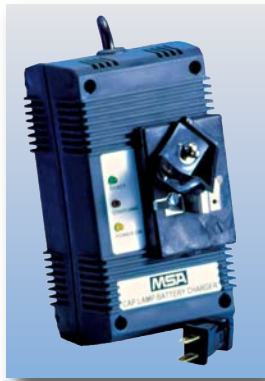
Single-unit Power Builder charger