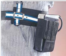
Multipurpose Miner's Pouch