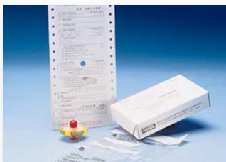
Coal Dust Sampling Cassette

The ATO System makes it easy to custom order Escort ELF pumps, configured exactly the way you want them. Choose from an extensive line of base instrument components and accessories. See pages 94–95 or Bulletin 0810-33 ATO System and Price Information for the Escort ELF Sampling Pumps for more information.