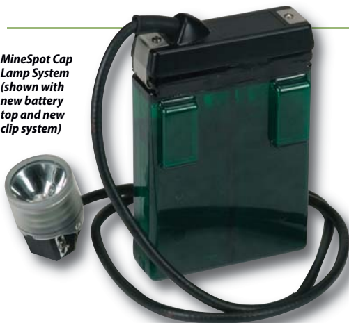
MineSpot Cap Lamp System (shown with new battery top and new clip system)