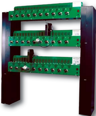
Power Builder 10-Unit Charging Stations are stackable. Front only or back-to-back. Leg kit shown.