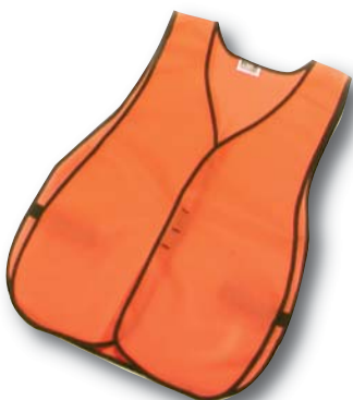
High Visibility Safety Vest