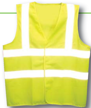
Class II Safety Vest