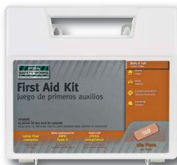
160-Piece First Aid Kit