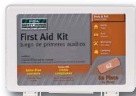
62-Piece First Aid Kit