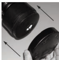
motion for attaching spark cover