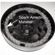
check for spark arresting optional material

Note: The spark arresting material inside the spark cover is optional.