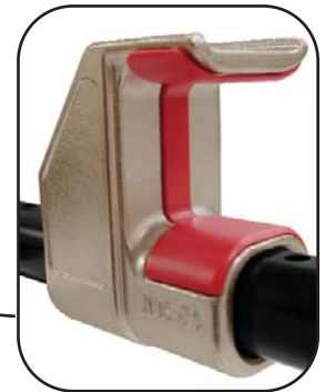
Glide Pads with Teflon