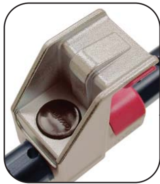
Push button adjustment