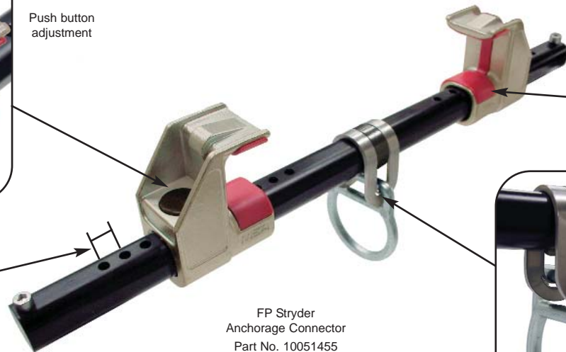
FP Stryder Anchorage Connector Part No. 10051455