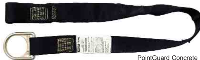
PointGuard Concrete P/N 10042794

Install the PointGuard Concrete Anchorage Strap by sliding the sewn loop onto the rebar before pouring the concrete form. Allow concrete to cure before using the PointGuard Strap as an anchorage point.