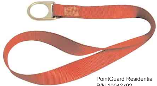
PointGuard Residential P/N 10042792

Install the PointGuard Concrete Anchorage Strap by sliding the sewn loop onto the rebar before pouring the concrete form. Allow concrete to cure before using the PointGuard Strap as an anchorage point.