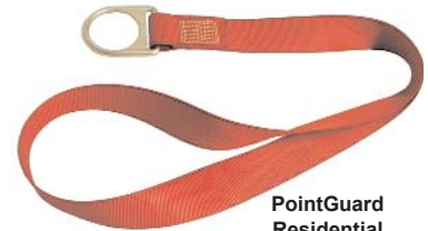
PointGuard Residential Anchorage Connector Strap Part No. 10042792

Designed to comply with all applicable OSHA regulations as well as ANSI A10.14 and ANSI Z359.1.