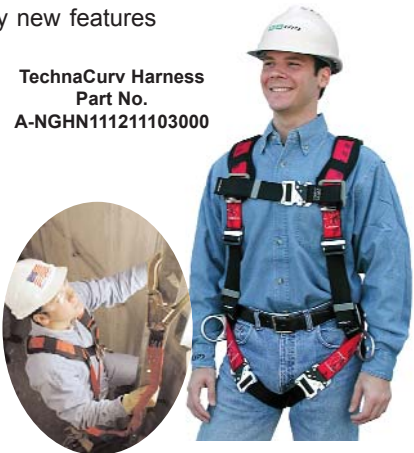
TechnaCurv Harness Part No. A-NGHN111211103000

In addition to the features above, the TechnaCurv harness is designed with downward adjusting torso straps on most models to ease adjustment. This is also the first harness on the market that allows you to order exactly the options you want, and only the options you want, through our Assemble-to-Order process. All these features combine to provide you with the most comfortable, versatile, unique, and safe harness available today.