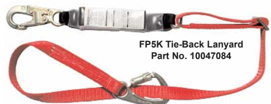
FP5K Tie-Back Lanyard Part No. 10047084

Note: This Bulletin contains only a general description of the products shown. While uses and performance capabilities are described, under no circumstances shall the products be used by untrained or unqualified individuals and not until the product instructions including any warnings or cautions provided have been thoroughly read and understood. Only they contain the complete and detailed information concerning proper use and care of these products.