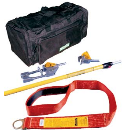
RCD System Part No. 501443

Great Solution for First-Man-Up Applications