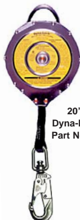
20' Strap Dyna-Lock SRL Part No. 506615