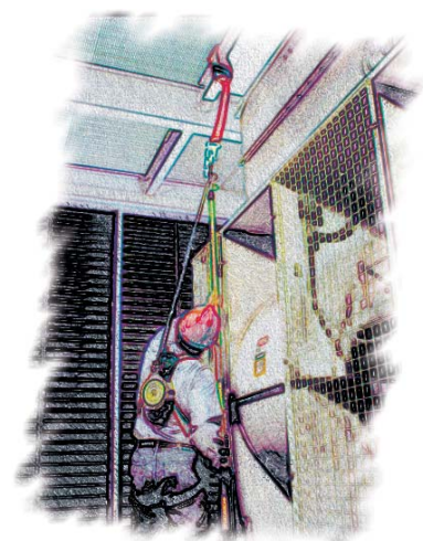
Dyna-Lock Backpacker SRL used with the RCD system.