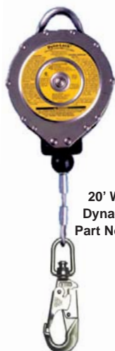
20' Wire Rope Dyna-Lock SRL Part No. 10017931