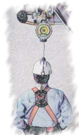
20' Wire Rope Dyna-Lock SRL in use

NOTE: All users of MSA mechanical products are still required to perform a pre-use inspection and a formal inspection of each mechanical unit in accordance with the user instructions, and as outlined in OSHA regulations, ANSI standards, and CSA standards.