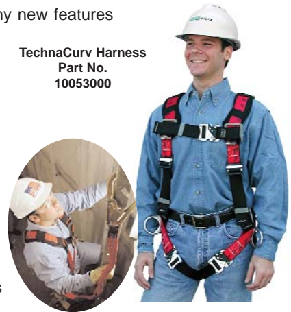
TechnaCurv Harness Part No. 10053000

In addition to the features above, the TechnaCurv harness is designed with downward adjusting torso straps on most models to ease adjustment. This is also the first harness on the market that allows you to order exactly the options you want, and only the options you want, through our Assemble-to-Order process. All these features combine to provide you with the most comfortable, versatile, unique, and safe harness available today.