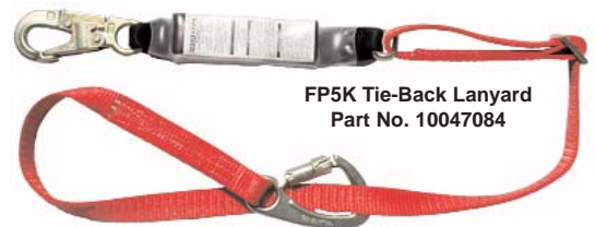
FP5K Tie-Back Lanyard Part No. 10047084

Note: This Bulletin contains only a general description of the products shown. While uses and performance capabilities are described, under no circumstances shall the products be used by untrained or unqualified individuals and not until the product instructions including any warnings or cautions provided have been thoroughly read and understood. Only they contain the complete and detailed information concerning proper use and care of these products.