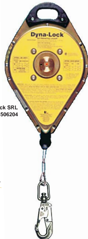
Dyna-Lock SRL Part No. 506204