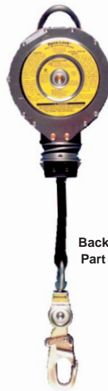
Backpacker SRL Part No. 506619