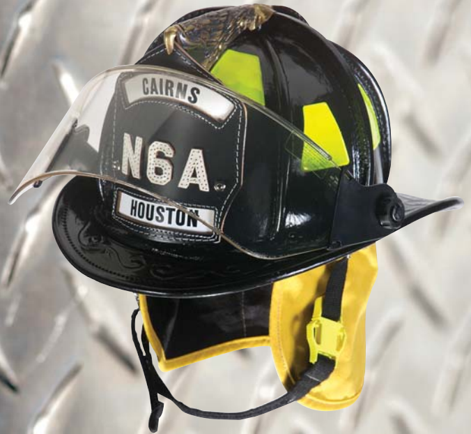
N6A Houston Helmet® Hand-crafted leather performance, taken to the next level