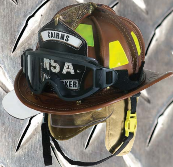
N5A New Yorker Helmet® There is no substitute, choose the original

Choose Cairns: Millions of firefighters for generations have!