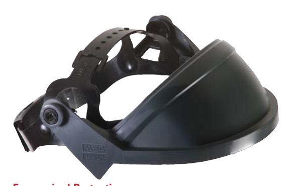
Economical Protection Defender+ (Plus) Faceshield Assembly With Pin-Lock Suspension

If you need face protection but do not wear a protective hard hat, select an MSA Defender+ (Plus) Faceshield Assembly. Faceshield Assemblies are lightweight, with flexible headbands that adjust to head sizes 6 1/2 to 8.