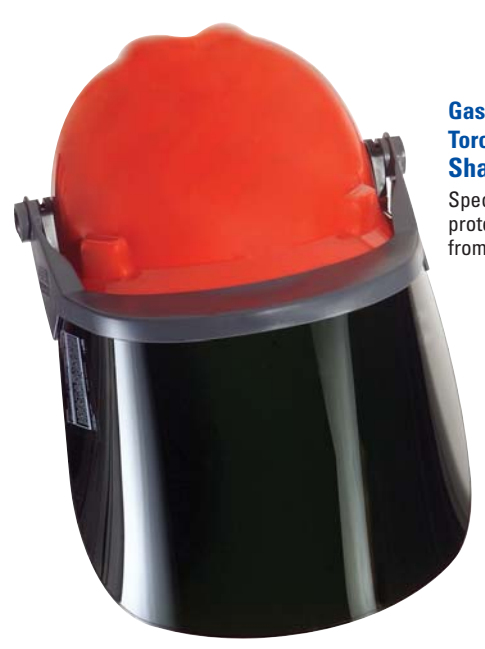
Gas Welding, Cutting or Torch Brazing and Soldering Shade 5 Visor

Special dark green Shade 5 protects against vision damage from infrared radiation.