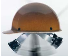
Skullgard with Swing-Ratchet Suspension