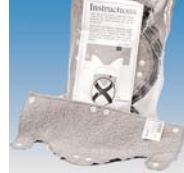
Custom Terri-Band Sweatband

Fits all MSA helmets. Provides excellent absorption, is easily washable and has no metal parts. Offers great fit and comfort.