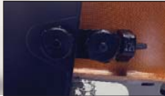
Plastic Instant-Release for Welding Helmet