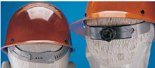
Staz-On® and Fas-Trac® Ratchet Suspension Systems