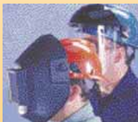
EC Adapter (left) and Sparkgard (right)—use plastic or metal Instant-Release with Sparkgard

Kits permit the easy attachment of Welding Shields and SparkGard Faceshields with visors to MSA's helmets.