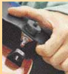
Metal Instant-Release Attachment