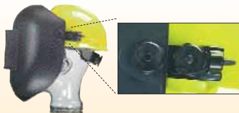
Plastic Instant-Release for Welding Helmet