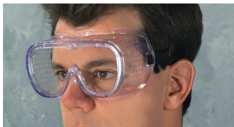
Softframe Perforated Single Lens Goggles