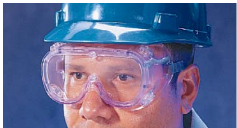
Softframe 4-Vent Single Lens Goggles

Softframe Goggles effectively fit most facial contours. Large, one-piece, .060-inch-thick polycarbonate lens provides wide, undistorted field of vision. Optional Anti-Fog Coated Lenses are available for work involving high humidity, temperature changes or greater worker exertion. The scratch-resistant coating is unaffected by most organic solvents, ammoniacal and alkaline detergents.