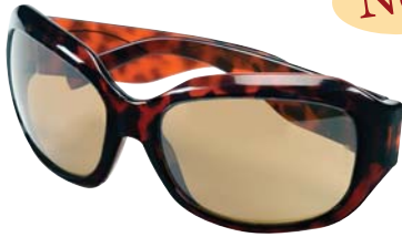
Safe and Sophisticated Eyewear