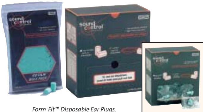
Form-Fit™ Disposable Ear Plugs, Handy Bulk Pack (left) and Dispenser Box (right)