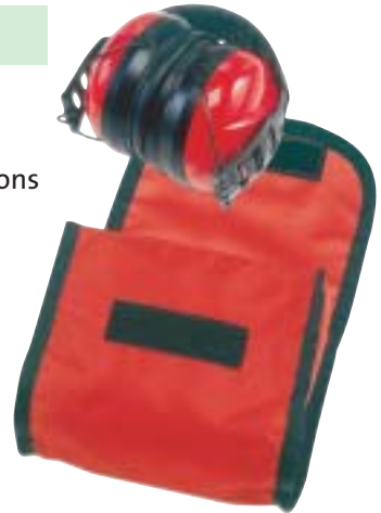
Apex 30™ with pouch