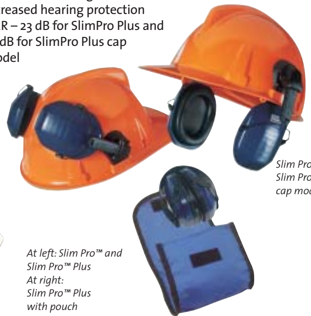
Slim Pro™ and Slim Pro™ Plus cap models