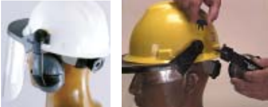
Ear Muffs for Defender Faceshield Frame