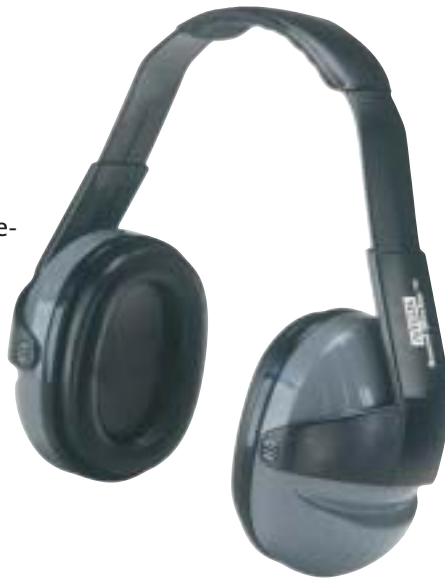
Sound Blocker™ 26