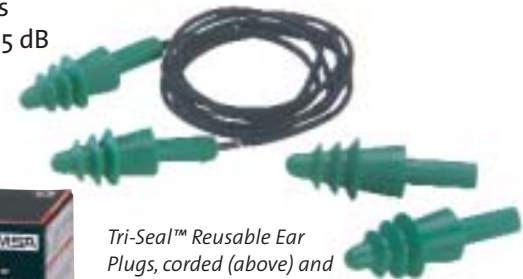
Tri-Seal™ Reusable Ear Plugs, corded (above) and uncorded (at right)