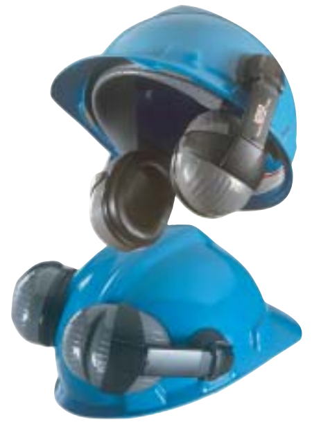
Sound Blocker™ 26 cap model