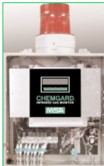
Figure 2. Interior of housing showing Chemgard Monitor with multipoint sequencer

Note: This Data Sheet contains only a general description of the product shown. While uses and performance capabilities are described, under no circumstances should the product be used except by qualified, trained personnel, and not until the instructions, labels or other literature accompanying the product have been carefully read and understood and the precautions therein set forth followed. Only they contain the complete and detailed information concerning this product.