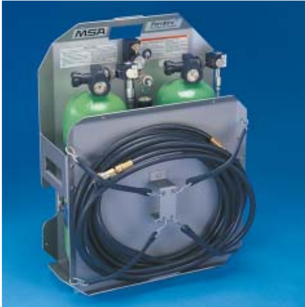
PortAire® Portable Air-Supply System