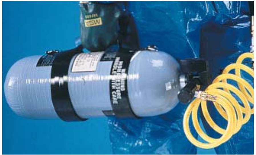
TransportAire™ Portable Air-Supply System