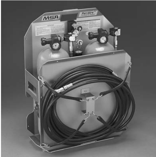
PortAire® Portable Air-Supply System