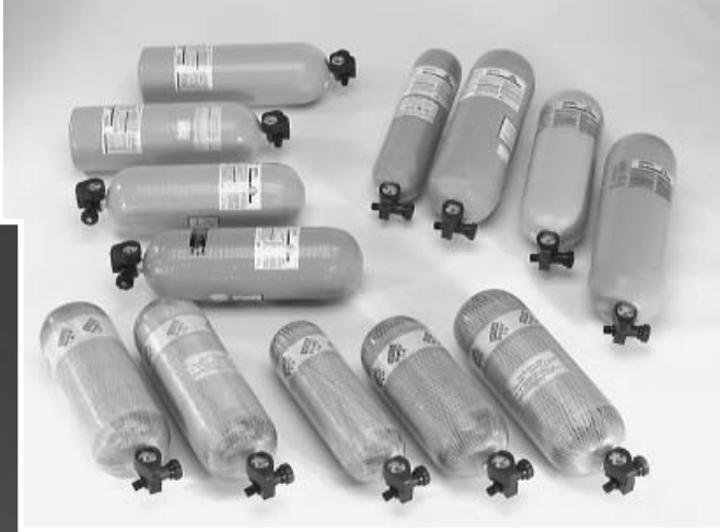
TransportAire™ Portable Air-Supply System