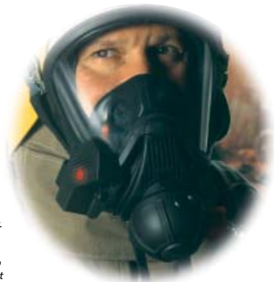
The FireHawk™ MMR is now available in two regulator attachments, the revolutionary Slide-To-Connect and the new Push-To-Connect attachment.