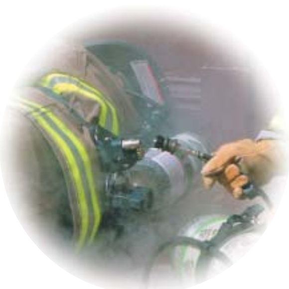
The Quick-Fill® URC is a universal rescue connection located within 4" of the cylinder valve outlet in the Audi-Larm™ housing.

Think of it this way: your job takes you to extremes. Shouldn't your Air Mask be able to go there, too? With MMR XTREME Air Masks, MSA matches your intensity level every step of the way.