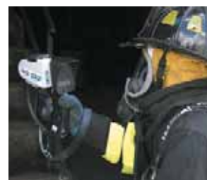
E5000 with Transmitter

Note: This Bulletin contains only a general description of the products shown. While uses and performance capabilities are described, under no circumstances shall the products be used by untrained or unqualified individuals and not until the product instructions including any warnings or cautions provided have been thoroughly read and understood. Only they contain the complete and detailed information concerning proper use and care of these products.