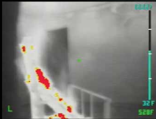
Evolution 5000 with Heat Seeker and Quick Temp - now with Digital Temperature Measurement.

Evolution TICs deliver unmatched performance to the Fire Service. Excellent image quality, wide field of view and highly functional Heat Seeker and Quick-Temp options provide the most comprehensive display of fire-scene information in high and low temperature environments. Advanced yet simple user indicators and warnings mean that you are using one of the best performing TICs in the industry.