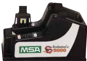
Truck-Mounted Charging System