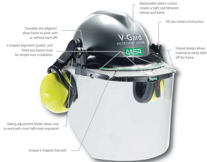
V-Gard Frame for Slotted Caps, with debris control. Shown with V-Gard clear polycarbonate visor and MSA left/RIGHT (HIGH), NRR 28 dB earmuffs and V-Gard cap.

For more information on MSA products check out these two great resources: