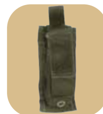
Mag Pouch Single .45 Caliber