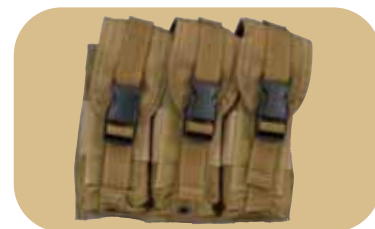
Mag Pouch Triple M4/M16