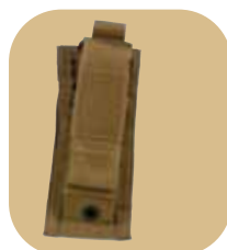
Mag Pouch Single 9mm