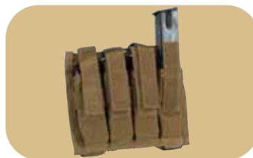
Mag Pouch Quad .45 Caliber