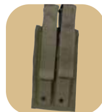
Mag Pouch Triple M4/M16