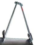
Part No. SHLARD6A