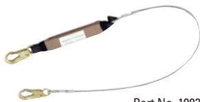
Part No. 10023485

The Thermatek shock absorbing lanyard was specifically designed to take the heat and for use in the welding industry.