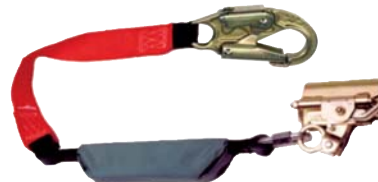
FP Pro Rope Grab with 3' Dyna-Brake Lanyard Part No. 415940