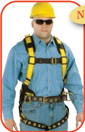
Workman Construction Harness Part No. 10077571