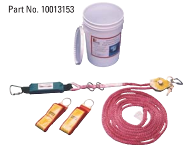
Part No. 10013153