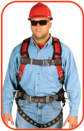
TechnaCurv Construction Harness Part No. 10054402