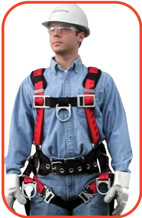
TechnaCurv Tower Harness Part No. 10048344