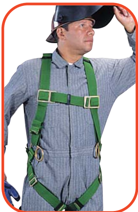
Thermatek Harness Part No. 10020062