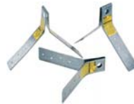
Disposable Roof Anchors Part No. 416068