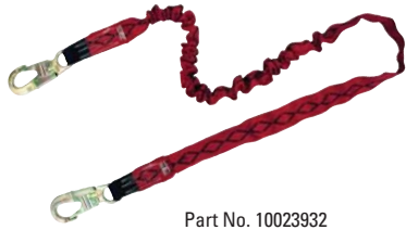
Part No. 10023932