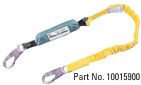
Part No. 10015900