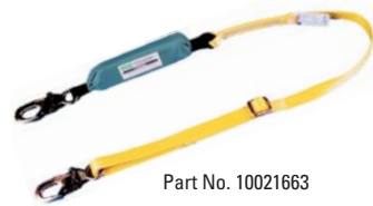
Part No. 10021663