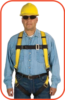
Workman Harness Part No. 10072479