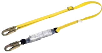
Workman Energy-Absorbing Lanyard Part No. 10072474