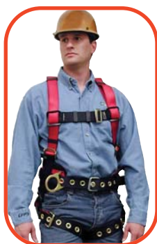
Part No. 10043033