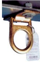
Part No. 506632