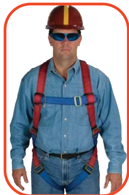
Gravity Harness Part No. SSH30420060