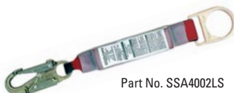
Part No. SSA4002LS