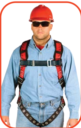
TechnaCurv Harness Part No. 10041599