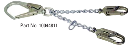
Part No. 10044811