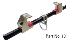
Part No. 10051455