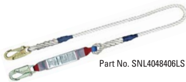
Part No. SNL4048406LS