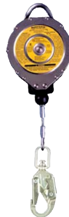
Part No. 10017931