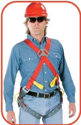
ArcSafe Harness Part No. 10070464