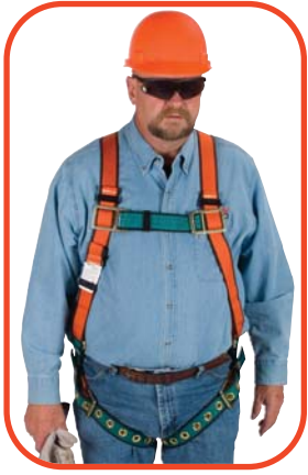
Part No. 502757