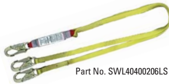
Part No. SWL40400206LS