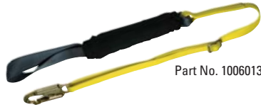
Part No. 10060139