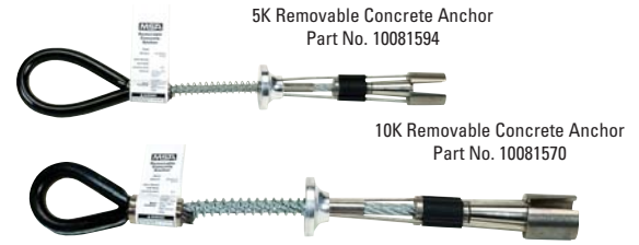
5K Removable Concrete Anchor Part No. 10081594