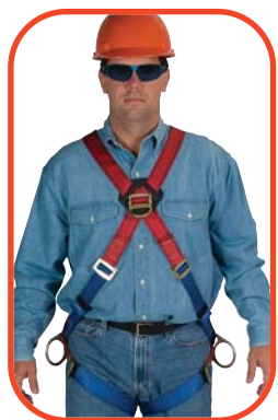
Gravity Harness Part No. SSH30420060