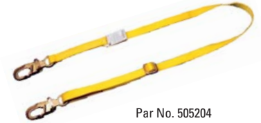
Par No. 505204