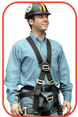
Gravity Harness Part No. SSH60930001