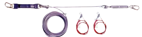
Part No. SHL2009060