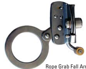
Rope Grab Fall Arrester Part No. 10054077