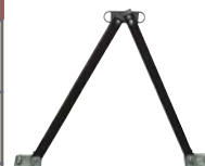
Part No. 10055659