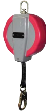
Part No. 10053558