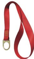
Part No. 10042792