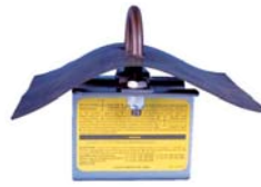
Part No. 10016468