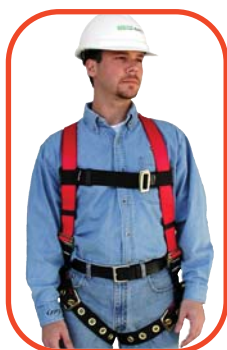
Part No. 10033836