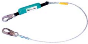
Part No. 10021655