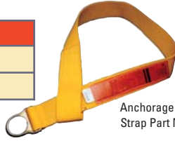
Anchorage Connector Strap Part No. 505282