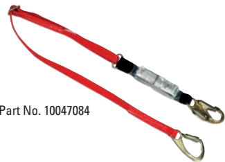
Part No. 10047084