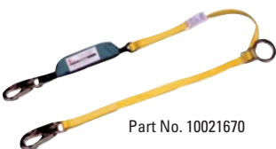
Part No. 10021670