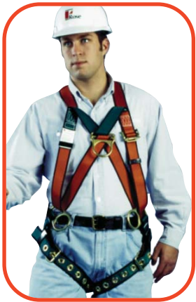
Part No. 502733