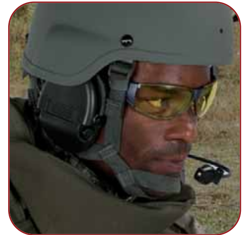
High Noise Headset with boom microphone and quick-disconnect