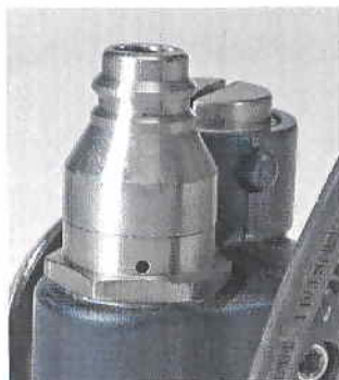
FIGURE 1 Typical Assembly

Note: Only authorized MSA or Aeroquip personnel should re-tighten the coupling.