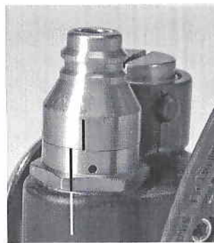
FIGURE 3 Loose at Coupling Joint