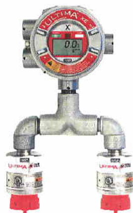
Ultima X 3 Gas Monitor