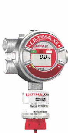
Ultima XE Gas Monitor

This notice applies only to explosion proof sensors with stainless steel housings. General purpose sensors with plastic or stainless steel housings are not affected. The photos below depict the type of gas monitors affected.