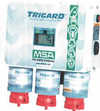
Trigard Gas Monitor