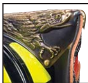
Carved Brass Eagle