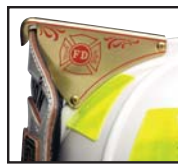
Silk-Screened Maltese Cross