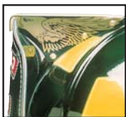
Silk-Screened Brass Eagle