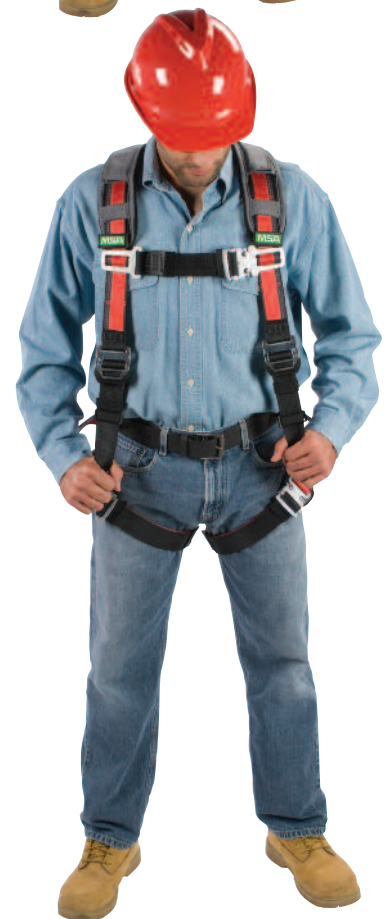
Patent-pending single-hand torso adjustment buckles simplify harness adjustment