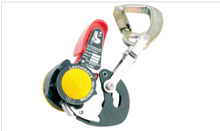
Ladderlatch Attachment Device

Latchways attachment devices are designed to connect the user, wearing a full body harness, to a Latchways cable system. These devices allow hands-free operation for system users. The unique starwheel allows the device to pass over cable supports without the need to detach.