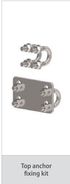
Top anchor fixing kit