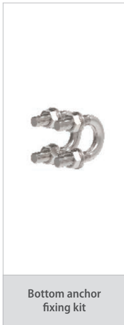
Bottom anchor fixing kit