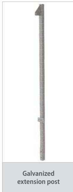
Galvanized extension post