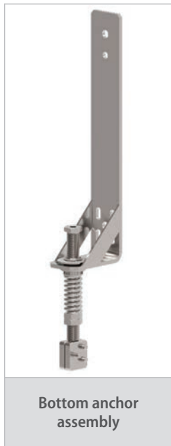
Bottom anchor assembly