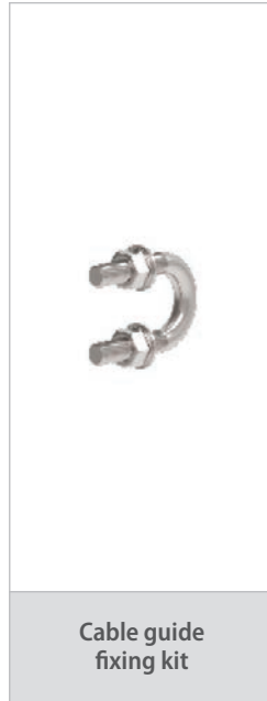
Cable guide fixing kit