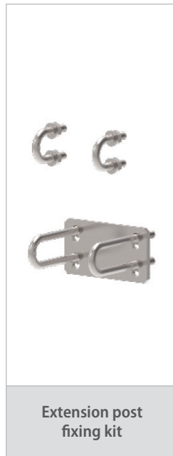
Extension post fixing kit