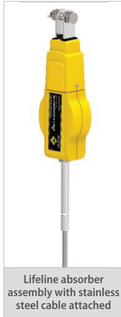
Lifeline absorber assembly with stainless steel cable attached