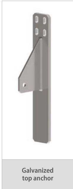
Galvanized top anchor