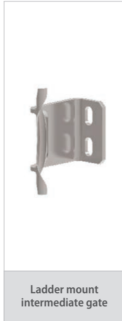
Ladder mount intermediate gate