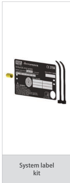
System label kit