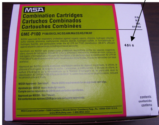
Carton of Six Cartridges