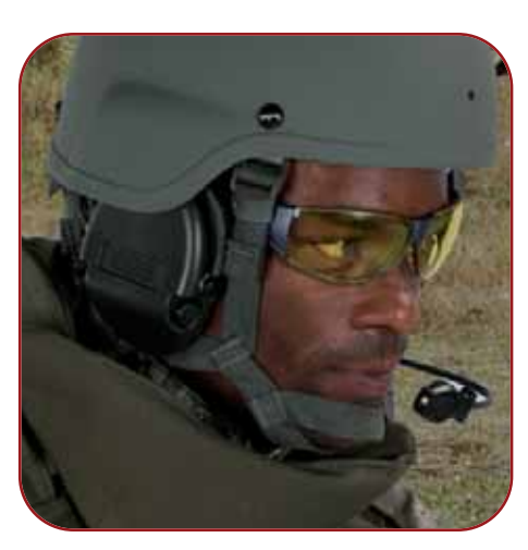
High Noise Headset with boom microphone and quick-disconnect