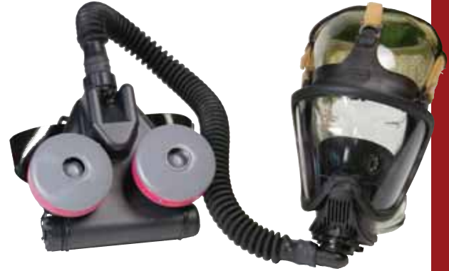
C420 PAPR with Ultra Elite Facepiece and multigas cartridges