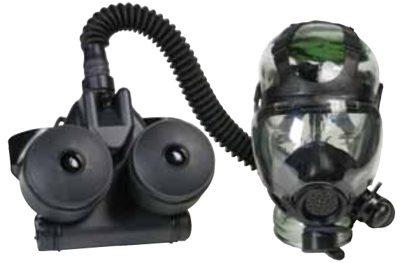
C420 PAPR with Millennium Facepiece and CBRN cartridges

The C420 comes complete with the motor-blower, belt, airflow indicator and breathing tube.